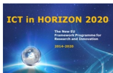
EU Framework Programme H2020

... set as high level objectives for European collaborative projects