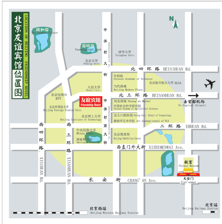
Figure 1: The location of Beijing Friendship Hotel in Beijing