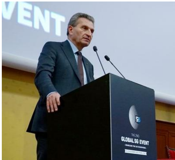
Figure 2: Commissioner Oettinger’s speech at the “2 nd Global 5G Event” in Rome

Furthermore, an exhibition (opened in parallel to the conference) with 24 booths was organised. The latest results and demos from 17 5G PPP Phase 1 projects were showcased there and networking among players from all over the world took place in a productive and dynamic atmosphere.