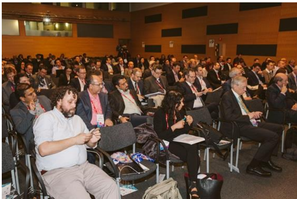
Figure 6: Around 160 people attended the 5G IA's Press & Media Event at MWC 2017

The media coverage was very good with many articles published in online and offline publications worldwide reporting on the event (e.g. Mobile World Daily, Article in The Standard Special Issue, Telecom TV).