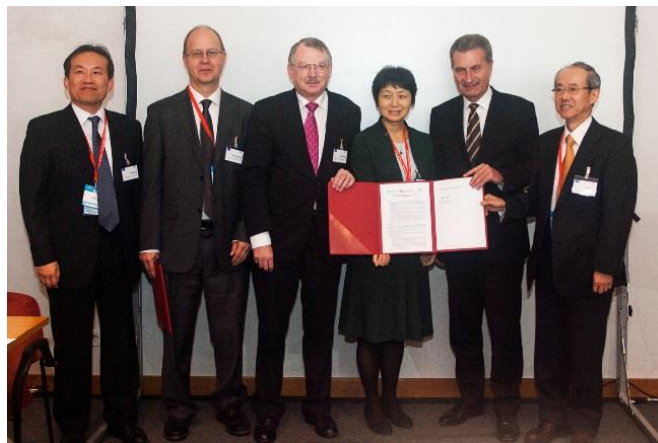
Figure 1: Signature of the Multilateral MoU in Lisbon

After the 1 st Global 5G Event, which was held in Beijing on 31 May – 1 June 2016, two more Global Events were organised.