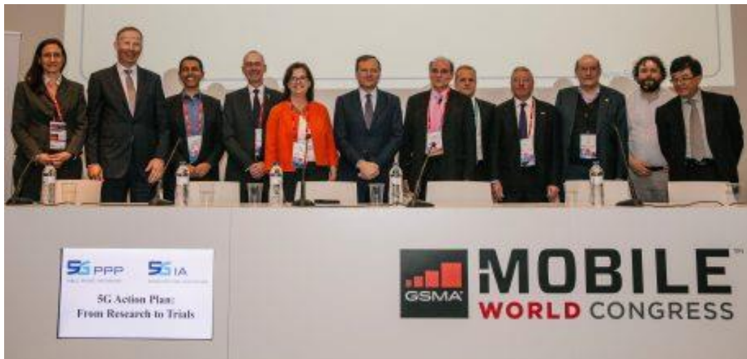
Figure 5: Speakers and Moderator

A 5G trials roadmap strategy was discussed for the implementation of advanced pre-commercial and pan European trials to be launched in key sectors in 2018 and promoted through European public events, in view of ensuring Europe leadership in the context of the accelerated global agenda for the introduction of 5G.