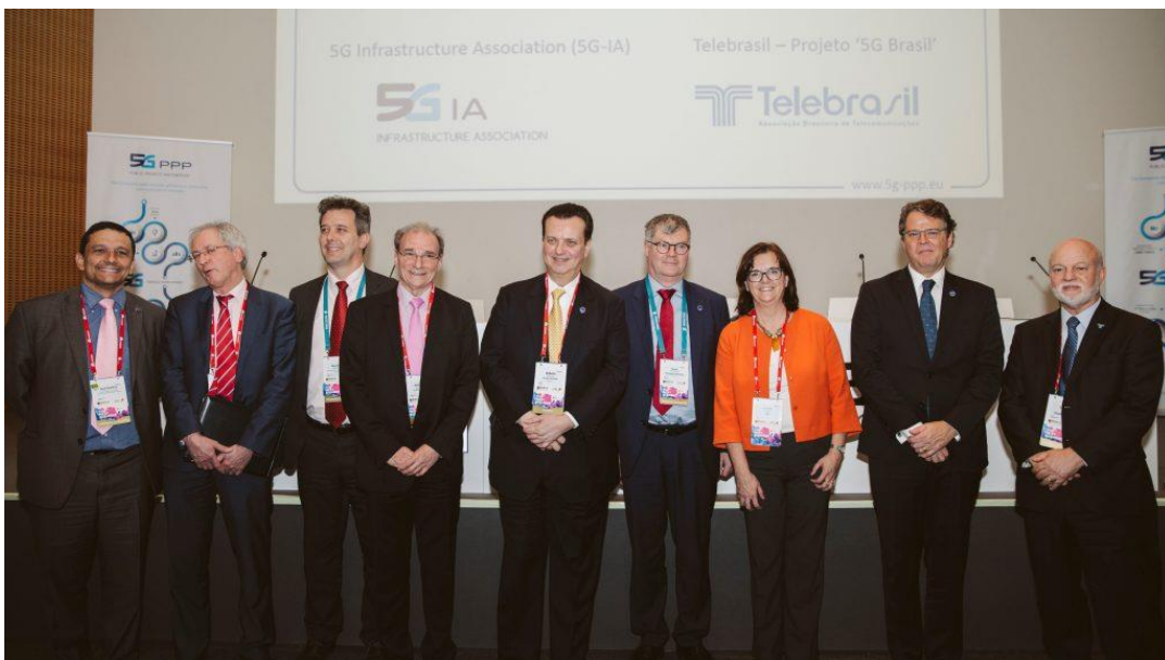
Figure 7: Signature of the MoU between the 5G IA and “Telebrasil – Projeto 5G Brasil”

The signing ceremony was followed by questions from the press.